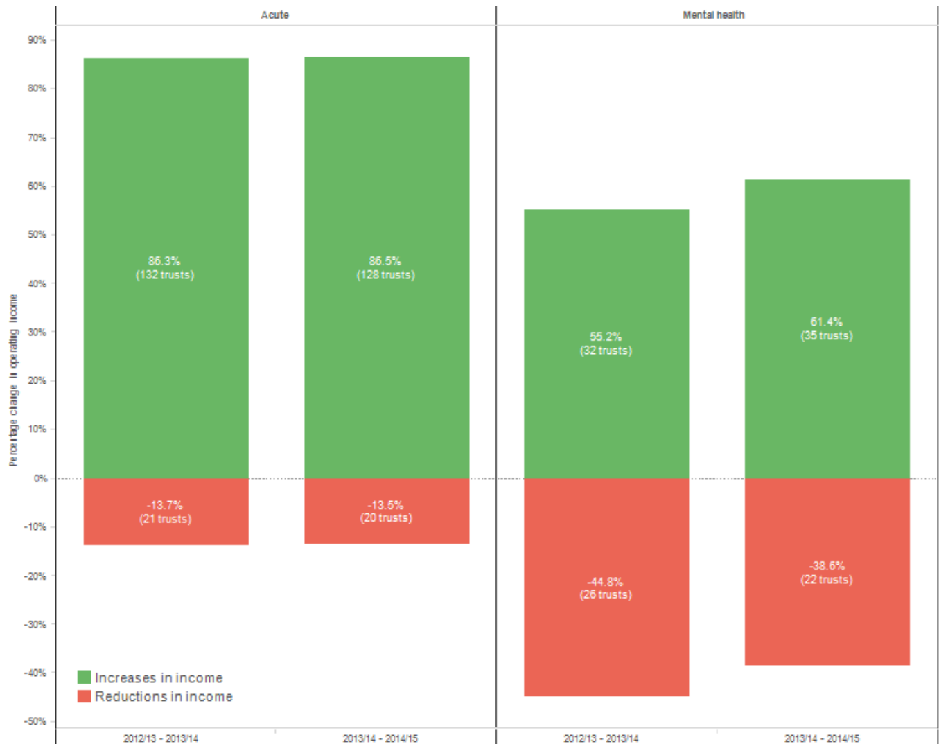
Figure 1 Percentage change in operating income for acute and mental health trusts