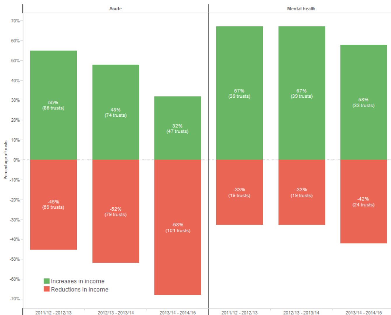
Figure 2 Proportion of acute trusts and mental health trusts in surplus/deficit at the end of the financial year